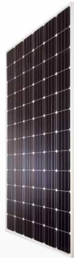
1956 x 992 x 40 mm Black Frame / White Backsheet