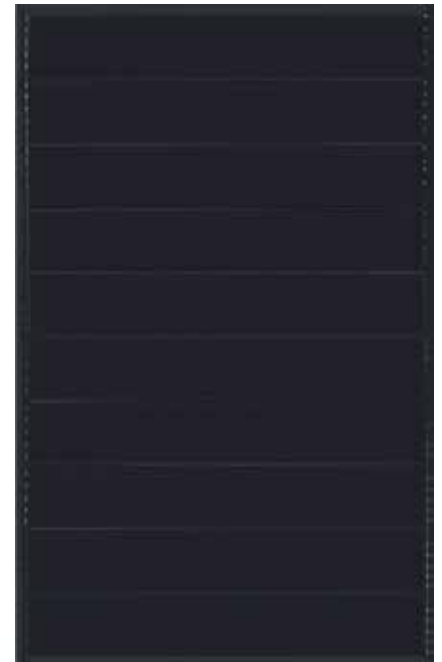
Black Frame Black Backsheet